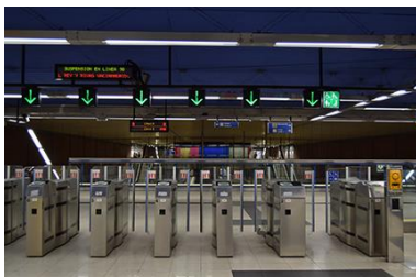
You can exit without swiping your card.

At stations in zone A, you'll arrive at a different exit barrier to the turnstile.