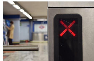
You may not go through the turnstiles with a red flag.

At other stations, you need to swipe your card again like at the entrance.