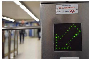
You need to go through the exits indicated by a green arrow.