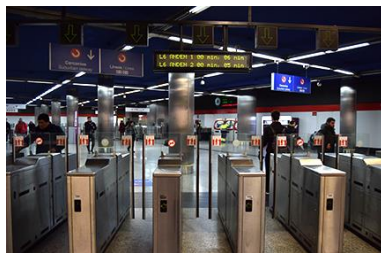
With sliding gates.

The turnstiles of the stations look like this: