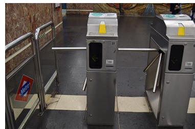
With access turnstiles.